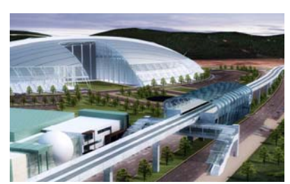
"Nave de Macau" Station

The C260 section covers an area extending from the "Pai Kok" in Taipa, to the east of the Cotai area, including viaducts from Station number 16 to Station number 23 and 4 stations: