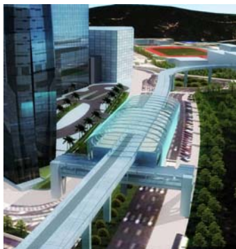
"Zona Este do Cotai" Station

The overall project was established to meet the needs of the population and thus connect the main points of entry and exit in the Macao Peninsula and Taipa / Cotai Zone. Spatial distribution of residents, especially the spatial distribution of active population, the tourism demand, the landscape design and technical feasibility are the key factors in implementing this major project for the development of Macau.