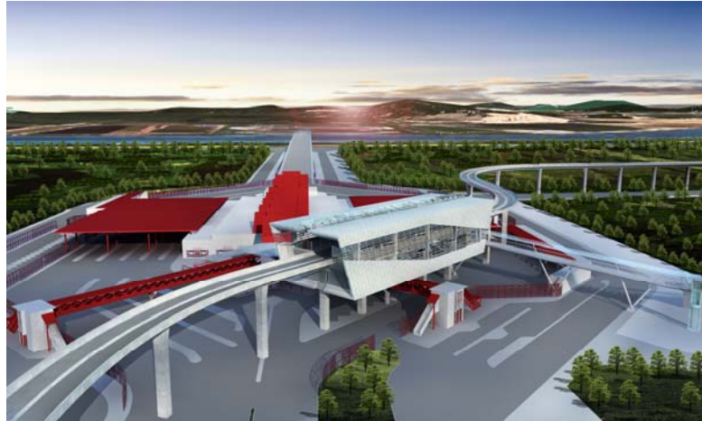
"Posto Fronteiriço da Ponte Flor do Lótus" Station

Client / Employer Government of the Macao Special Administrative Region Transportation Infrastructure Office